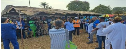
Patients waiting to be attended to

Some of the cases we dealt with were common ailments such as malaria, typhoid, pain, diabetes, hypertension, worms, upper respiratory and urinary tract infections. Clients with eye and ear infections were referred. Skin infections were treated. Other clients were treated and referred to local hospital for follow up care were Parkinson Disease, Cardiac issues, gynecological issues. Clients with sickle cell disease were treated for pain and referred for follow up care. Some of the challenges we encountered were shortages of certain medications and medical supplies in providing comprehensive care.