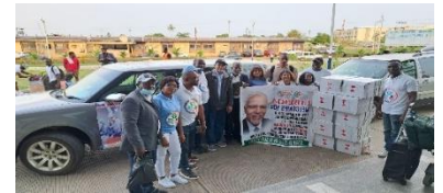
Team y Meds

To all our friends, prayer partners and supporters. We would like to thank you for partnering with us in the most recent Medical Mission to Liberia, West Africa (March 7 – 29, 2024). The Lord has been most wonderful in putting the right team together (4 from Canada, 3 from the USA and 1 from Guyana). Considering all the satanic hindrances encountered prior to the trip, we can truly say “greater is He that is in us than he that is in the world.” We were very happy with