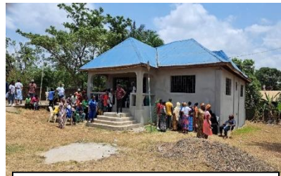
Patients waiting for optical service

During the weeks of medical clinics, we held optical services where patients had their eyes checked and