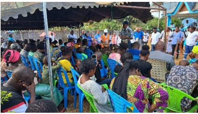
Devotion with patients