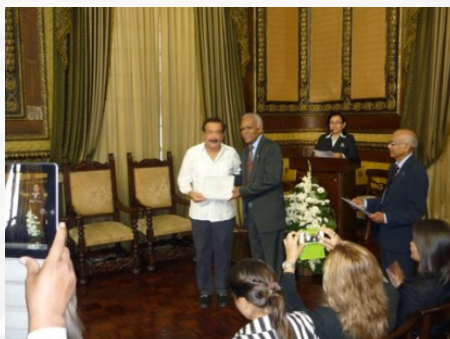
Mr. Jaime Nebot, Mayor of Guayaquil